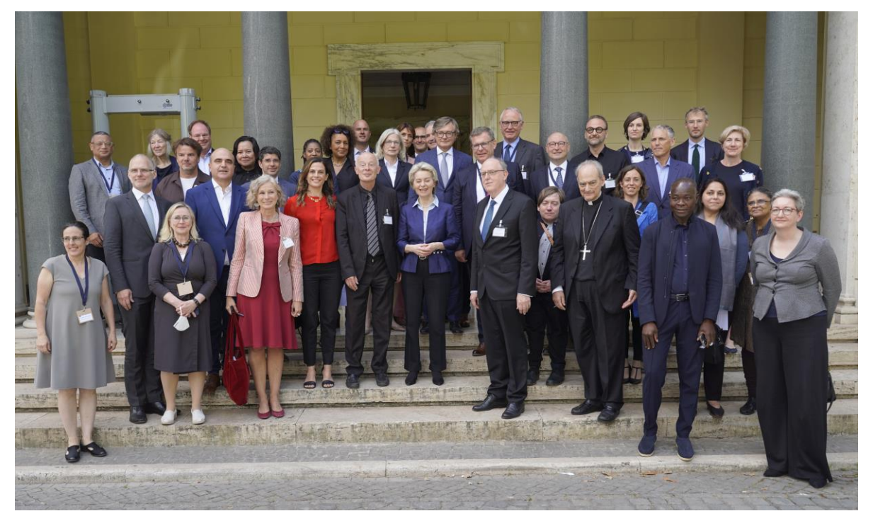
(3) Group picture of PAS conference speakers.