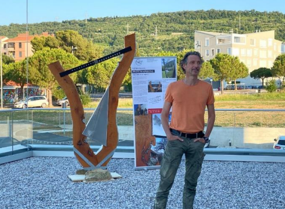
Acoustic experiments and musical interventions at the InnoRenew building.