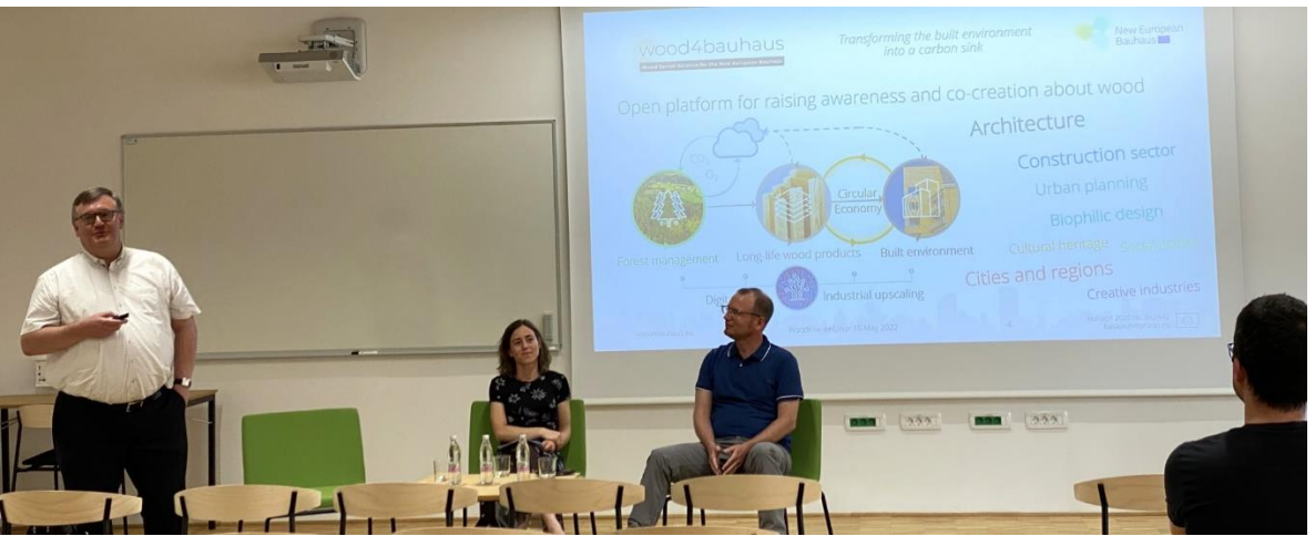
Presentation of the Wood4Bauhaus Alliance and the demonstration projects InnoRenew building, Basajaun and EcoReFibre.

In the second part of the NEB event, the participants could experience the demonstration of scientific equipment to measure the acoustic behaviour of wooden buildings as well as musical instruments made from wood.