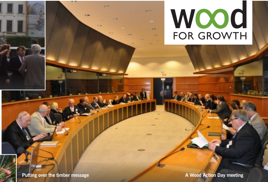
Putting over the timber message

“We aim to raise annual output by €2.35 billion, or 4% annually, which would generate €405 million in increased tax, create 80,000 jobs and reduce EU atmospheric CO2